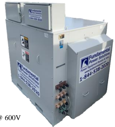
500kW @ 600V