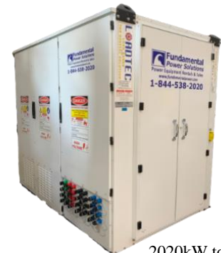
2020kW to 3200kW @ 600V

This is just a sample of the inventory we have available for rental. Contact us with your requirements: