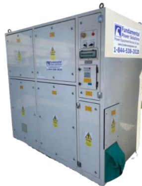
700kW to 1000kW at 480 & 600V