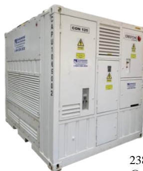
2380kVA/1426kvar @ 600V