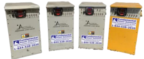
100kW @ 600V