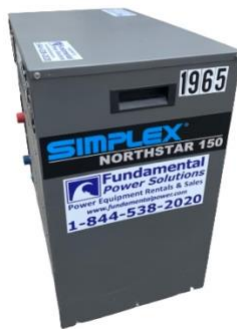
150kW @ 600V

The Advanced Generator Monitor was developed to answer the market's need for a real-time condition monitoring system. Unlike other limited monitoring systems, AGM looks beyond just one component of a power generation system and delivers real-time, data rich monitoring that delivers full spectrum visibility into your facility's power quality.